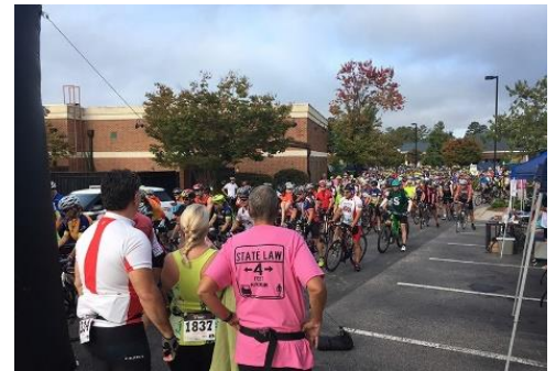
Cary It Green

This is the perfect time to grab your bike, go outside, enjoy the beautiful spring weather, and explore Cary from a new perspective...on two wheels! For a list of bike events throughout the region, please visit www.TownOfCary.org and search for "Bike Cary", or follow us on Facebook.